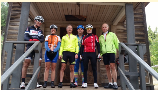
Brisk riders at the Golden Church on Oct. 24

It bears noting that the members, in a March 2015 membership survey, identified the Club's biggest challenge as..."to gain and maintain membership within the Club, with particular focus on attracting younger members." The survey can be referenced at https://drive.google.com/file/d/0B8SeM1z13XA-dTU4YVhVMWxVUmM/view . The Board is aware of the challenge and, if the Family Fun Rides are a measure of the Board's commitment to meeting these challenges, we are well on our way. Note that the Club's membership stands at 260, up by about 10 percent from December of last year. I'm proud to be a member of the Club's Board of Directors.