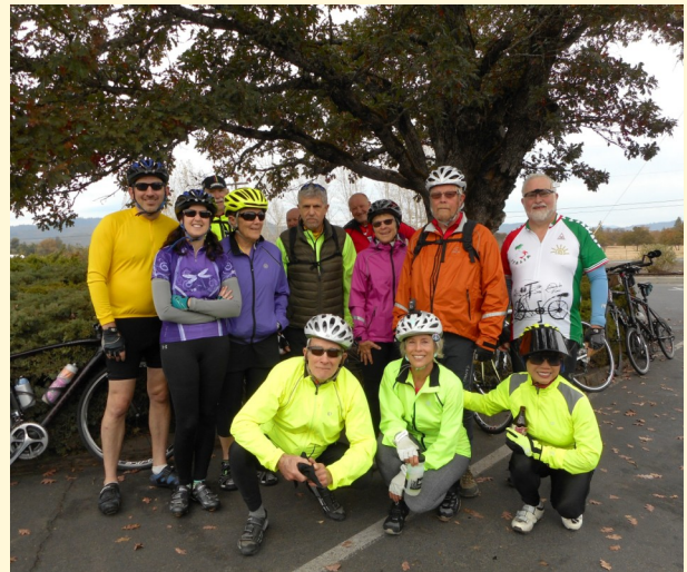
Velo Melos and Crankies at Rainey's Store on Oct 25