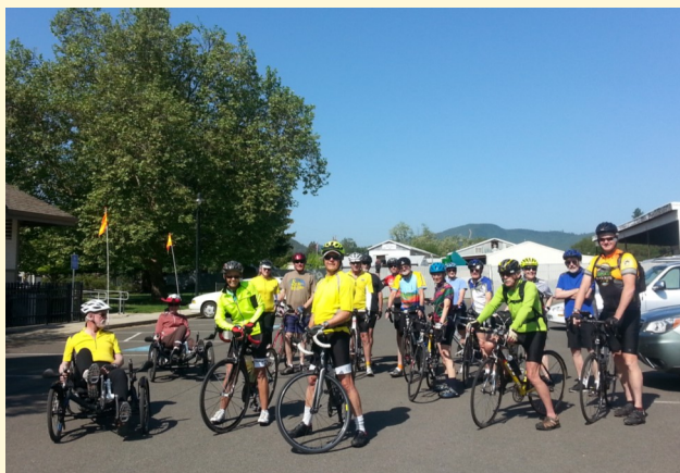
18 Velo Melos rode from Gold Hill to Rogue River on May 2

What's still on your cycle bucket list? To ride across America!!!!!! I can't wait to get this on my calendar.