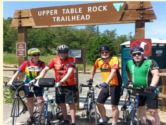
Annual Velo Club Ride & Hike from Central Point to Upper Table Rock and back on May 9