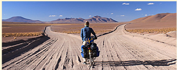
Eastern Peru: Hope everything is there and packed right.

A handle bar bag makes touring much easier. Your map is always right under your eyes. Much needed items like your wallet, phone, camera and snacks are available while riding. Your cockpit is complete. Remember not too much weight in the handle bar bag. It's high on the bike