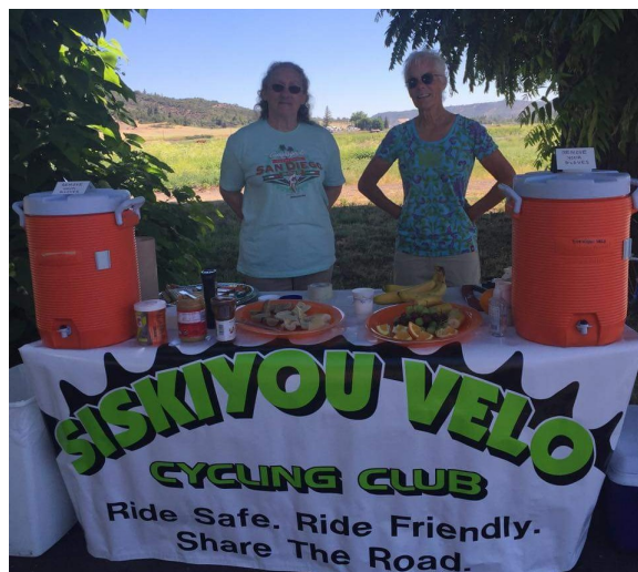
The Velo Club sponsored a rest stop for the Eagle Point Century on June 13