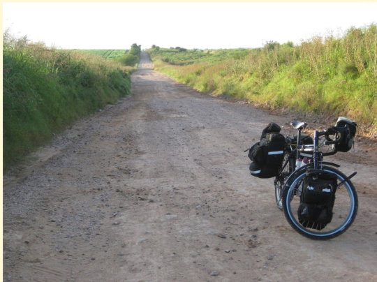
Southern Uruguay: a great day of cycling

When you stop next to the road to get something out of a pannier you want to use your right (inside) bags as much as possible. Keep your spare tubes and tools in the right