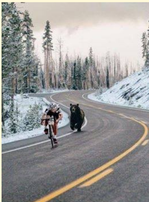
Somewhere in Canada....