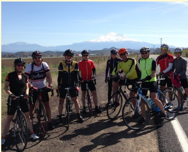
Brisk Lites in the Shasta Valley on March 7