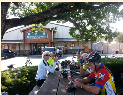
Crank It Up ride on August 9