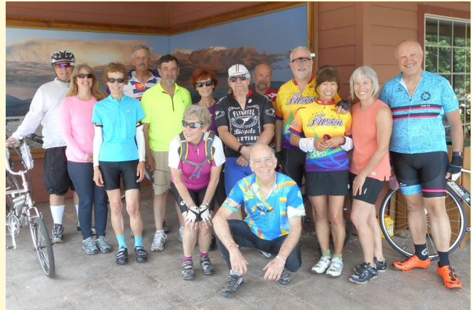
July 11 Mello Velos at Lake Creek Store